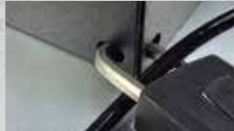
5/16” Cable Attachment ports