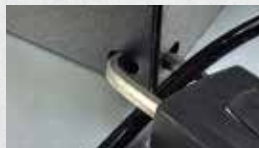
5/16" Cable Attachment ports